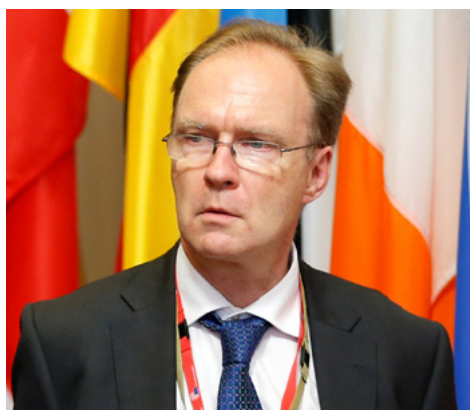
SIR IVAN ROGERS