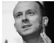
Tim Harford Senior Columnist Financial Times