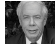
John Kay Economist