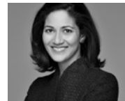
Mishal Husain Broadcaster and Journalist