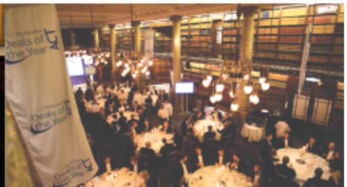
In full swing: Deals of the Year 2008 ceremony under way at One Whitehall Place, part of The Royal Horseguards hotel, on the banks of the Thames.