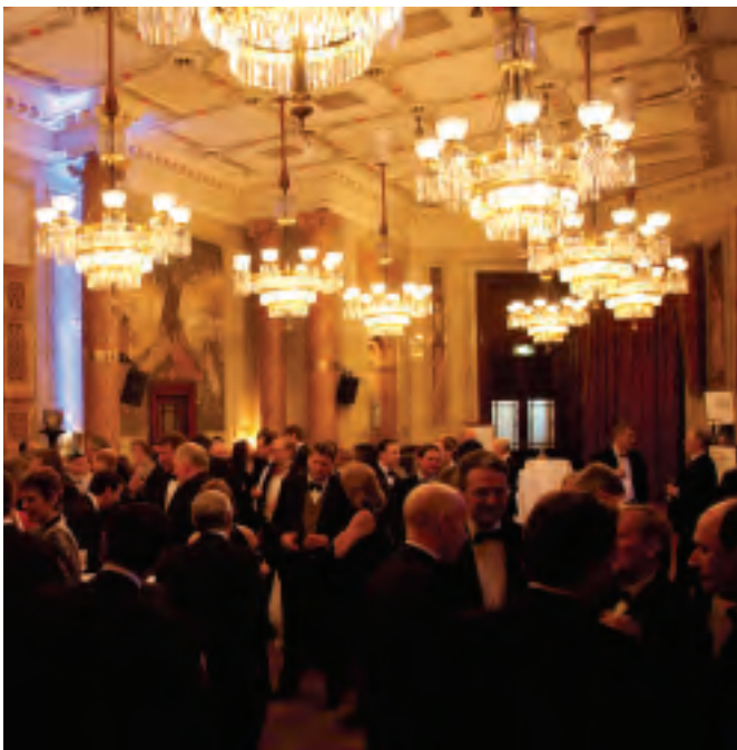
The Deals of the Year ceremony taking place at One Whitehall Place in London.

For more details on the winning deals and the highly commended deals, see the February 2010 issue of The Treasurer, or go to www.treasurers.org/awards