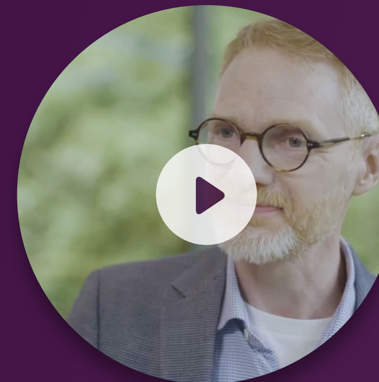
Here's how your fellow members described the ACT in three words

Your continued commitment places you at the forefront of the profession - with your designatory letters you demonstrate leadership, forward-thinking insight, and a dedication to best practice, helping you stand out among your peers.