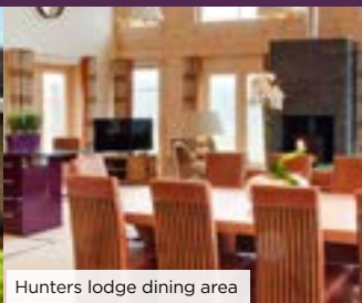
Hunters lodge dining area